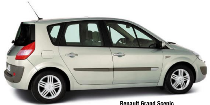
Renault Grand Scenic

Nissan sales performed well in 2005 with a 12% growth to 24,553 units compared to 21,853 units in the previous year in a very competitive market environment. The year also saw the successful introduction of the Nissan Urvan, a versatile 14-seater van and the brand new facelift versions of the X-Trail, Cefiro and Sentra.